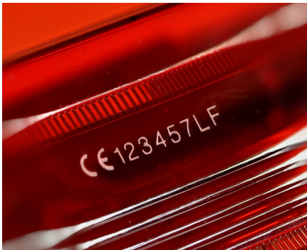
Glass & transparent plastics