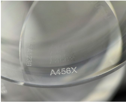
Marking on labels