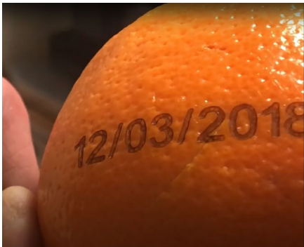
Fruits & vegetables marking