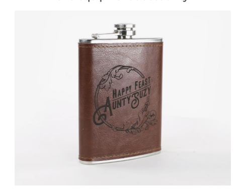
Gifts & personalization