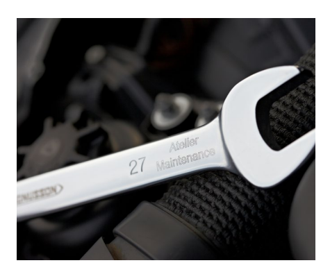
Marking tools for identification and equipment traceability