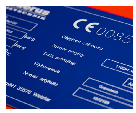
Traceablity of industrial parts