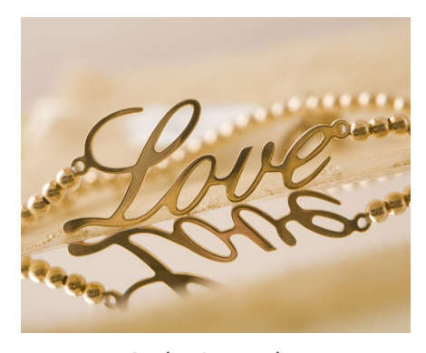
Cutting & engraving