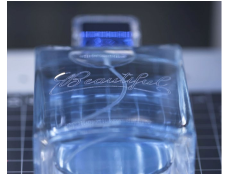
Cosmetics & luxury