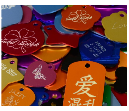
Pet and dog tags engraving