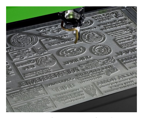
Engraving & laser cutting of custom ink stamps