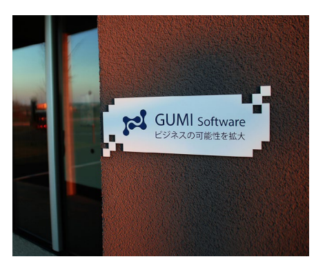
POP displays and sign engraving