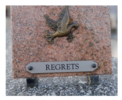
Funeral plaques and headstones engraving