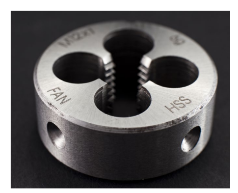
Marking tools for identification and equipment traceability