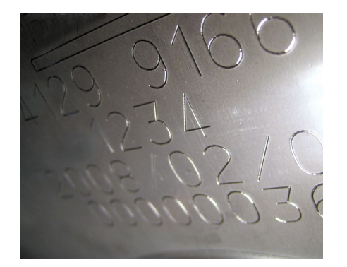
Stainless steel marking