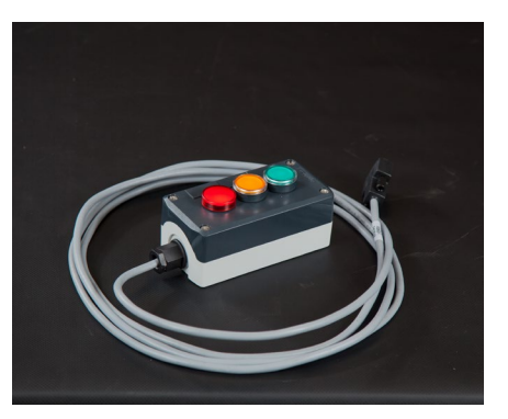
Process Control Box