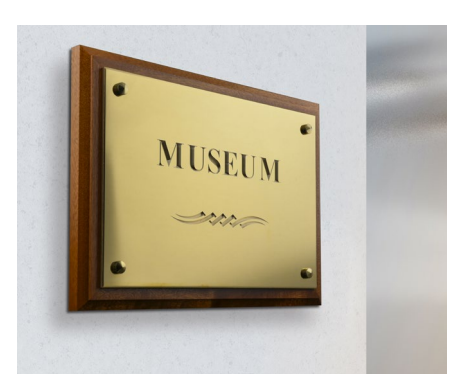
Professional and institutional plates