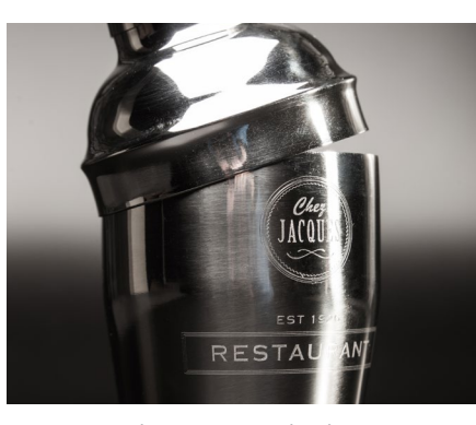
Gifts & personalization