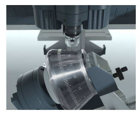
Large part marking & traceability