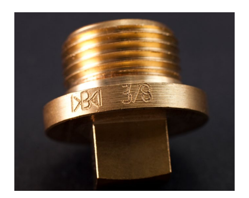
Various small parts