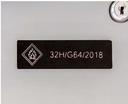
Marking tools for identification and equipment traceability