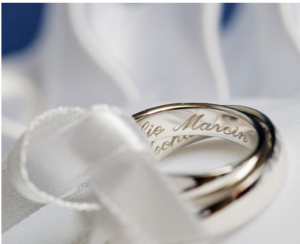
Personalizing and engraving jewelry