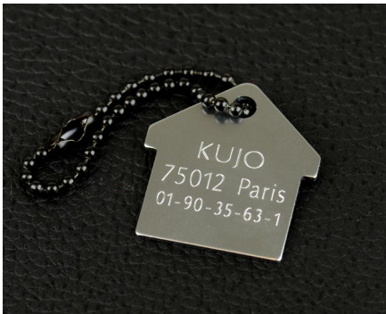
Pet and dog tags engraving