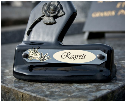
Funeral plaques and headstones engraving