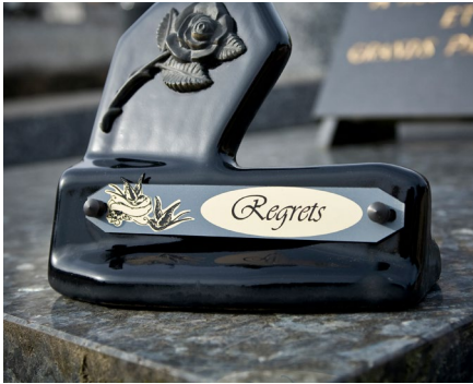
Funeral plaques and headstones engraving