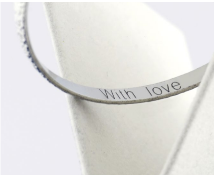
Personalizing and engraving jewelry