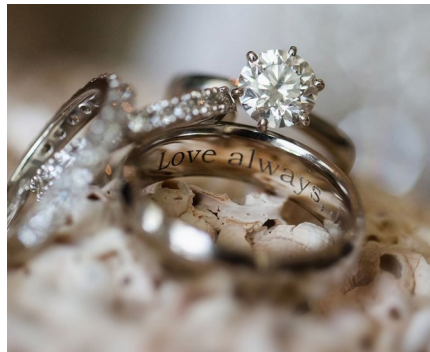
Personalizing and engraving jewelry