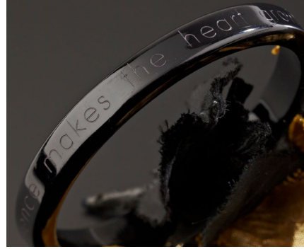
Personalizing and engraving jewelry