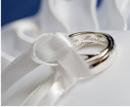
Personalizing and engraving jewelry