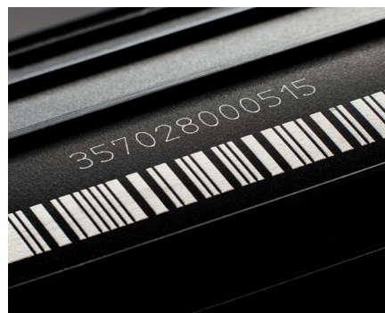
Contrasted marking on plastic