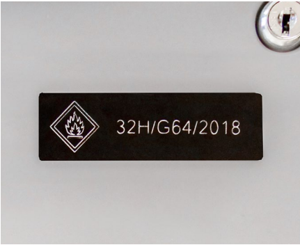
Marking tools for identification and equipment traceability