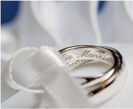
Personalizing and engraving jewelry