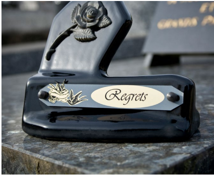
Funeral plaques and headstones engraving